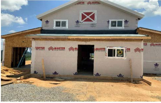
Rear View of Barn