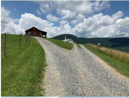
View from driveway entering property