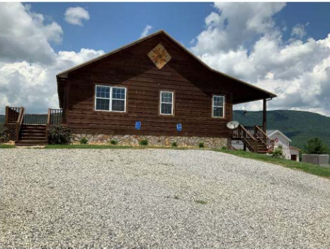
Parking Area, Side