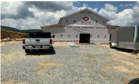
Front View of Barn