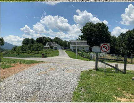
Lutz Property, Adjacent to entrance