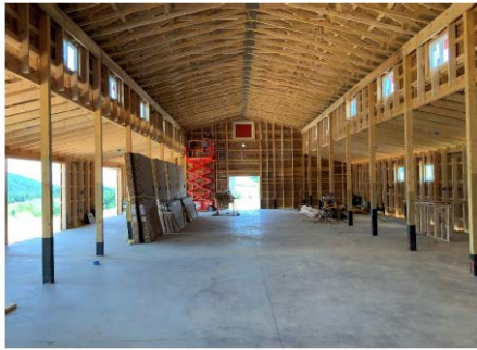
View from rear looking back to entrance