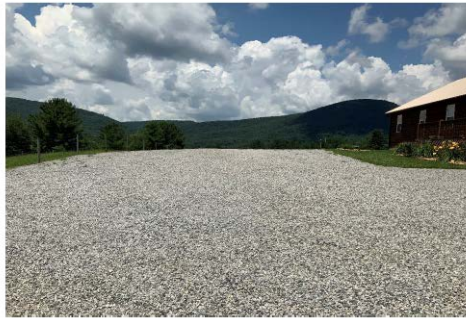
Parking Area, Rear