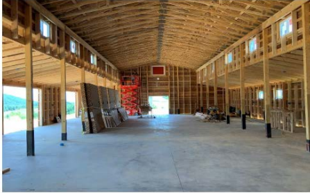
Interior Entrance View